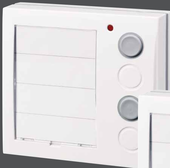
BZ920 Two-button model