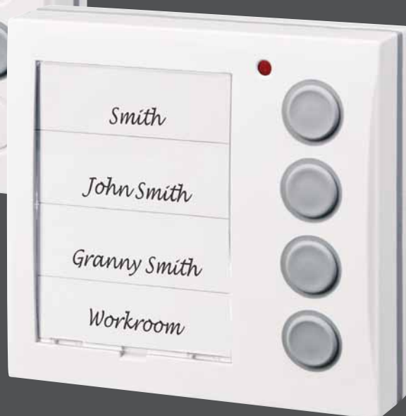
BZ940 Four-button model